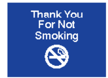
8" x 6" NS0806 PI Thank You For Not Smoking