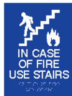
6" x 8" ICF0608 PI In Case of Fire Use Stairs