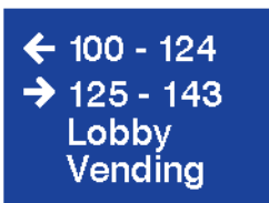
10" x 7-1/2" DIR1008 PI Small Directional, 3-4 Lines