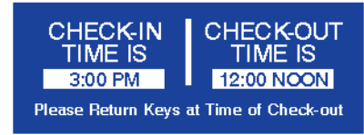
16" x 6" CHI 606 PI Check-In/Check-Out Informational