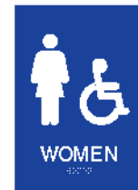
6" x 8-1/2" RR0609 PI Restroom Identification