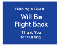
8" x 6" HG0806 PI Helping a Guest Informational - Bent Sign