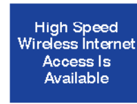
8" x 6" INT0806 PI Internet Access Informational