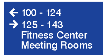
14" x 7-1/2" DIR1408 PI Large Directional, 3-4 Lines