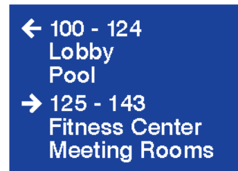
14" x 10-1/4" DIR1410 PI Large Directional, 5-6 Lines