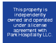
8" x 6" OPP0806 PI Owner/Operator Board