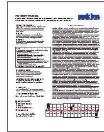
8-1/2" x 11" FEP0911 PI Guest Room Fire Evacuation Plan and Lodging Laws - Paper

Also available in 8-1/2" x 14" - Paper FEP0914 PI