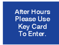
8" x 6" KC0806 PI Key Card Informational