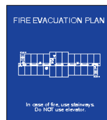
9" x 10" EE0910 PI Elevator Evacuation Plan