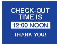
8" x 6" CH0806 PI Check-Out Time Informational