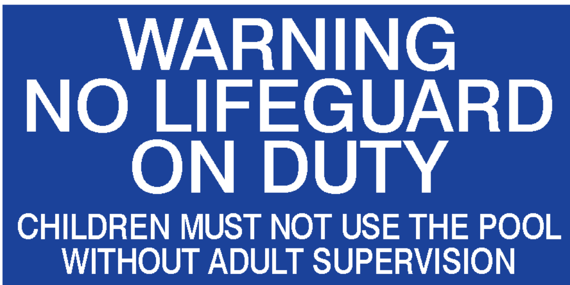
47-1/2" x 23-1/2" NLD4824 PI Warning No Lifeguard on Duty