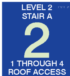
12" x 13" STR1213 PI Stairwell Identification & Information